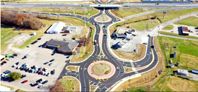
KY 351 roundabouts in final configuration

At the end of 2024, construction was 75% complete! Drivers saw a tremendous amount of progress in Henderson. The reconstructed KY 351/2nd Street interchange opened with three new roundabouts. The new US 41 interchange opened in temporary configuration, portions of future I-69 opened to traffic, and seven new bridges were also complete.