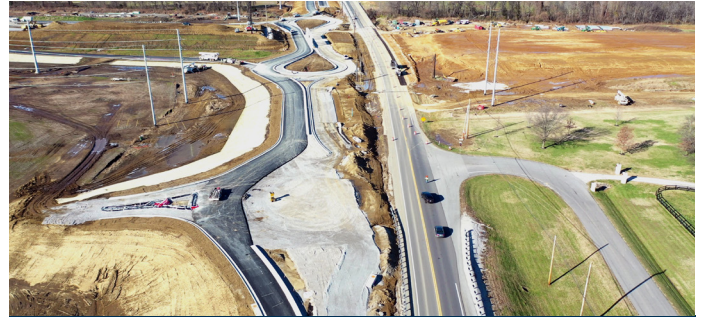
US 60 roundabouts under construction